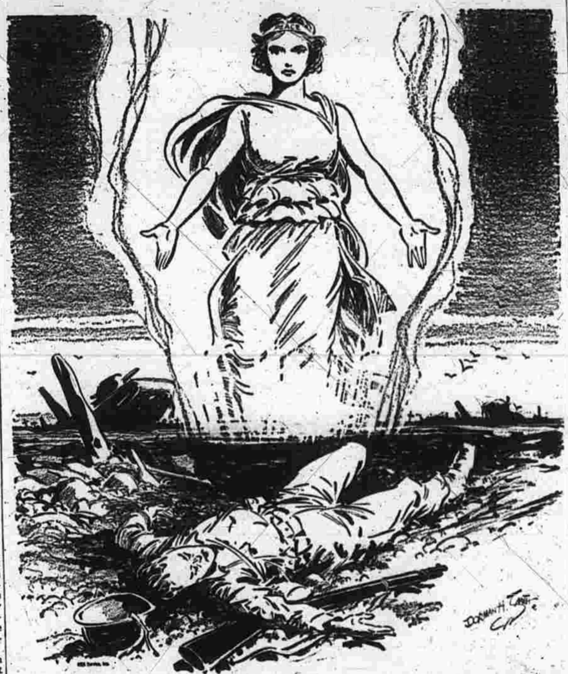
State Starts 2-Day Holiday Over Victory